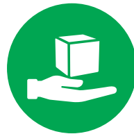
Omnichannel and In-Store

All qualified executives receive a full participation package that includes travel, hotel accommodations, meals and networking activities. This ensures a cost-effective and quality peer-to-peer experience for attendees.