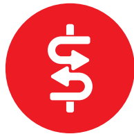
Marketing and Merchandising